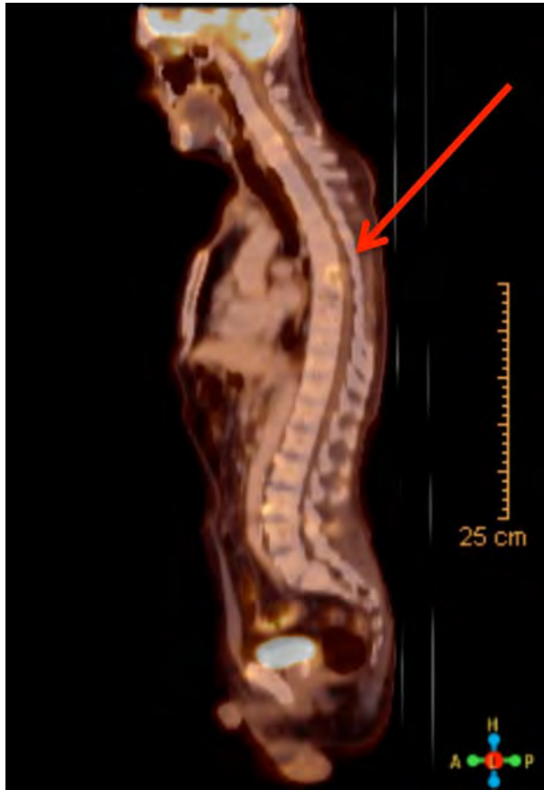
Figure 2 Sagittal PET-CT image of a spine metastasis. Location of spinal metastasis (red arrow) in a CT-merged 18F-fluorodesoxyglucose positron emission tomography (PET).

considerably improved with reduced nausea and back pain and improved appetite and weight gain. After a new rise in calcium levels, another 60 mg of denosumab were injected, yet again followed by reduced and stable serum calcium levels over months despite high PTH levels. In total, six doses of denosumab during the following months led to stable calcium levels without further need for inpatient treatment. By November 2014, PTH levels peaked at 413 pg/ml; however, another denosumab injection sufficiently stabilized serum calcium. Clinically relevant side effects were not observed. Resection of a new supraclavicular metastasis on the left side in August 2014 did not affect PTH levels significantly. In February 2015, another three cervical metastases were removed. Again, after repeated Denosumab injections, calcium levels remained above normal but stable until the last follow-up in May 2015. The follow-up period included 25 months in total after the first denosumab injection.