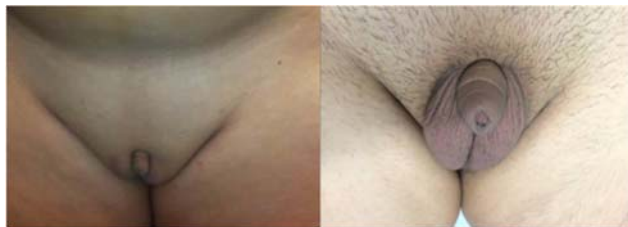
Figure 1 Scrotum and penis before (a) and after (b) testosterone replacement.

The clinical phenotype is characterised by complex plurimalformative syndrome: musculoskeletal anomalies (congenital talipes equinovarus, hypotonia, clinodactyly, radioulnar synostosis, scoliosis, hip dysplasia, pes cavus or planus) (3); alteration of neurocognitive development, mental retardation and brain malformations, such as white matter lesions (5); metabolic and hormonal alterations, such as hypergonadotropic hypogonadism, hypothyroidism and diabetes mellitus (6) (7) (8); and increased susceptibility to infections, atopy and immunodeficiency (9).