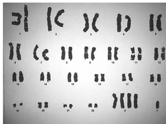
Figure 2 49,XXXXY karyotype (GTG banding).

Hypo-representation of the pubic hair system, testicular hypoplasia (volume 2 ml bilaterally, evaluated with a Prader orchidometer), non-palpable epididymis, micropenis (2.1 cm length stretched) (Fig. 1a), Tanner stage I; autonomous walking with clumsiness and postural changes