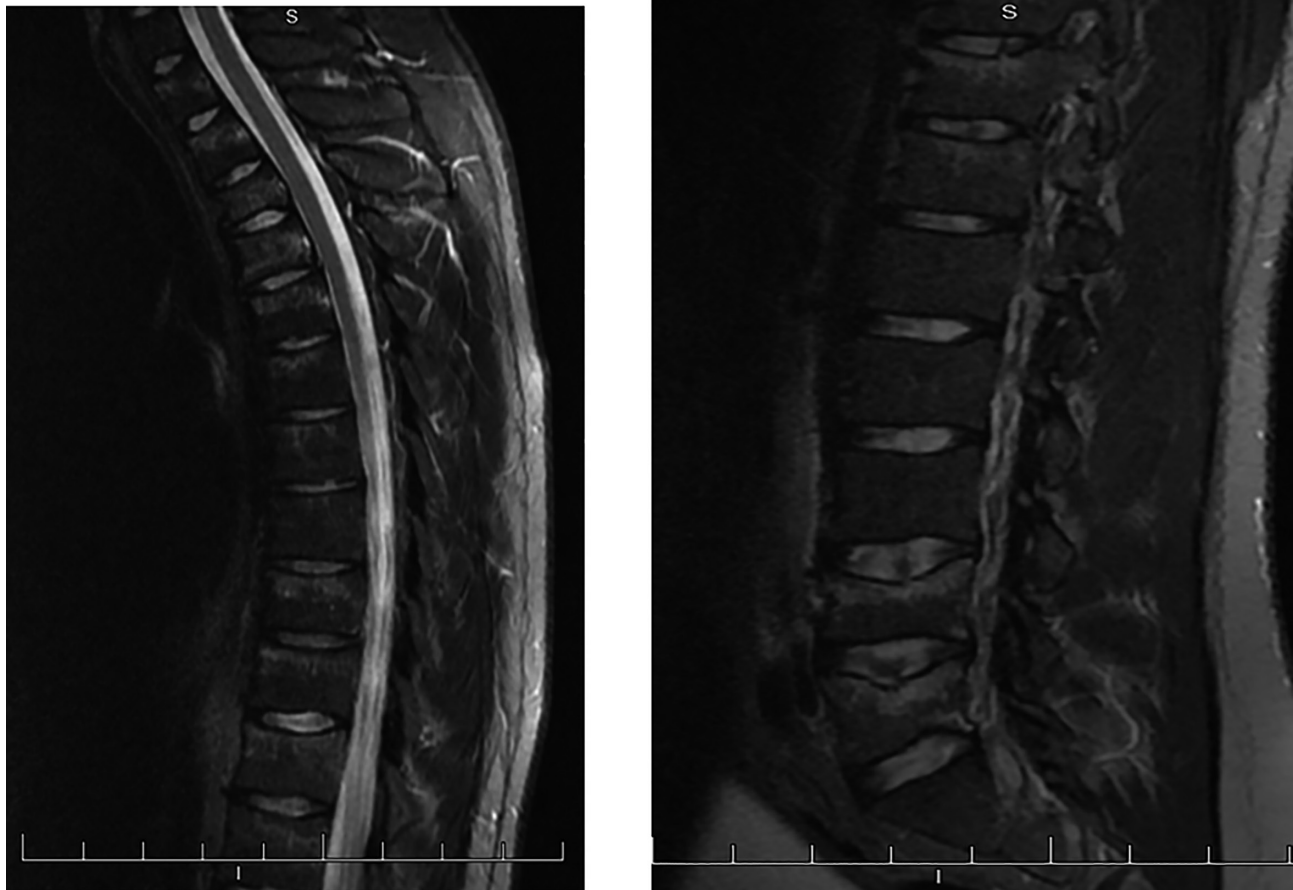
Figure 1 T2-sagittal MRI demonstrating hyperintense marrow signal abnormalities in several vertebral compression fractures. MRI, magnetic resonance imaging.

His history was significant for a 12-year duration of T1DM, which was managed with a basal-bolus insulin regimen, under the care of an endocrinologist. He reported good glycaemic control historically and self-monitoring of blood sugar levels several times a day with infrequent hypoglycaemic episodes. He was a non-smoker and only consumed alcohol socially. Dietary calcium intake was adequate, averaging three servings daily. There was no history of fractures in childhood, and no personal or