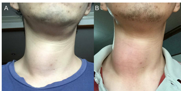
Figure 1 Anterior view of the patient's neck. At 2 weeks before visit (A) and at the first visit (B).