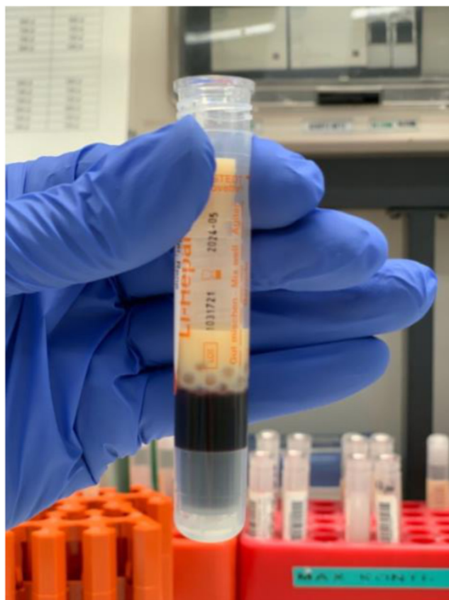
Figure 1 Patient's blood sample after separation with lipemic layer on the top.

320 mg/dL after more than 24 h from the last i.v. insulin application and before plasmapheresis and was sent to the referral laboratory; the C-peptide value was 0.97 µg/L (reference range: 0.81–3.85 µg/L). Anti-glutamic acid decarboxylase (anti-GAD), islet cell (anti-ICA) and protein tyrosine phosphatase (anti-IA-2) autoantibodies were also tested before plasmapheresis and were negative, yielding a diagnosis of T2DM.