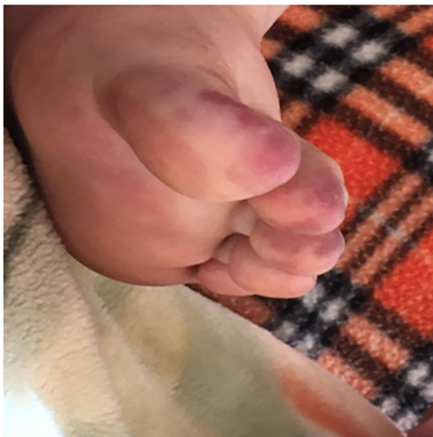
Figure 3 Left cyanosis toes.

After the suppression of systemic glucocorticoid excess by using ketoconazole and bilateral adrenalectomy, the