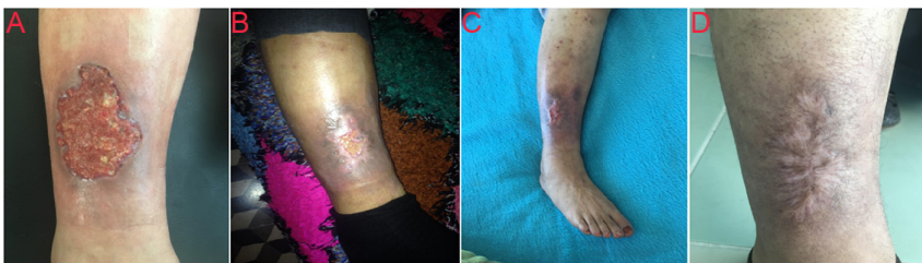
Figure 6 Evolution of the ulceration after 3 months (A), 6 months (B), 9 months (C) and after 1 year of the adrenalectomy and treatment with colchicine and bisphosphonate (D).

Calcinosis cutis is challenging to treat with no gold standard therapy available to date. Several therapeutic options have demonstrated improved outcomes such as calcium channel blockers that can correct the abnormal imbalance of intracellular calcium concentration and can lead to crystal formation. The use of colchicine as an antimicrotubule agent was found to be beneficial