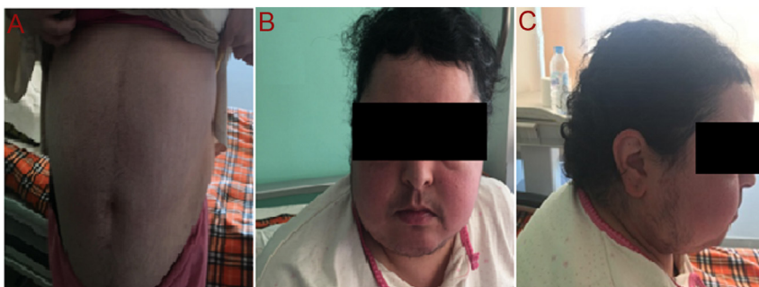
Figure 1 (A) Stretch striae on the abdomen and proximal portion of the lower limbs, abdominal adiposity, contrasting with thin legs, (B) facial swelling, erythrosis and dorso-cervical pad of fat, (C) marked hirsutism.

Blood pressure was controlled with triple therapy including amlodipine 5 mg/day, bisoprolol 10 mg/day and ramipril 10 mg/day. Glycemia was also well controlled under insulin and metformin. The colchicine was prescribed at a dose of 1 mg per day and risedronate at 35 mg was taken once a week without any remarkable improvement of pain or ulceration. After a multidisciplinary board meeting, we decided to perform bilateral adrenalectomy to treat this