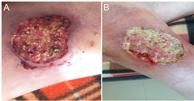
Figure 2 Cutaneous ulceration with focal extrusion of chalky granules.

severe and complicated Cushing's disease. To alleviate the associated signs and symptoms of Cushing's syndrome, a preparation was started by using ketoconazole (600 mg daily). FUC values returned to normal within 3 weeks after treatment with ketoconazole, and the ulceration was stable, less painful and less inflamed. The surgery went well without any complications.