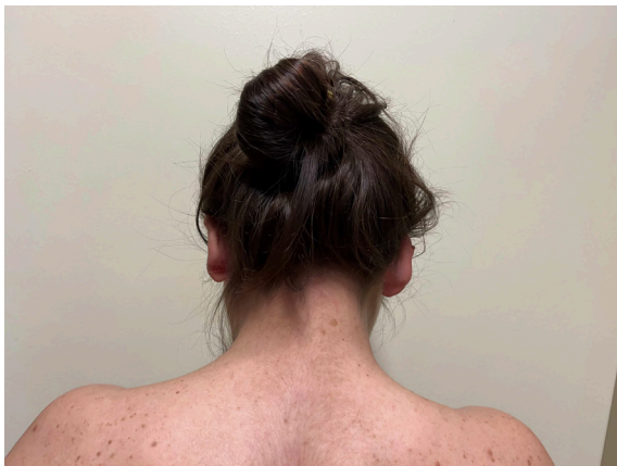
Figure 2 Phenotypical characteristics suggestive of TS with large and low-implantation earlobes, short neck and hypertelorism. TS, Turner syndrome.

She is currently 27 years old and has reached a height of 135 cm (significantly below her target family height of 165 cm) but has a normal BMI (21.9 kg/m 2 ). During the follow-up, she presented two HbA1c values of 5.8%; however, a return to normoglycemia was achieved through lifestyle measures. Heterogeneous echogenicity of the thyroid gland and positive anti-peroxidase antibodies were detected, making the diagnosis of autoimmune thyroiditis. The patient has been kept under multidisciplinary follow-up and no further endocrine abnormalities have been found so far.